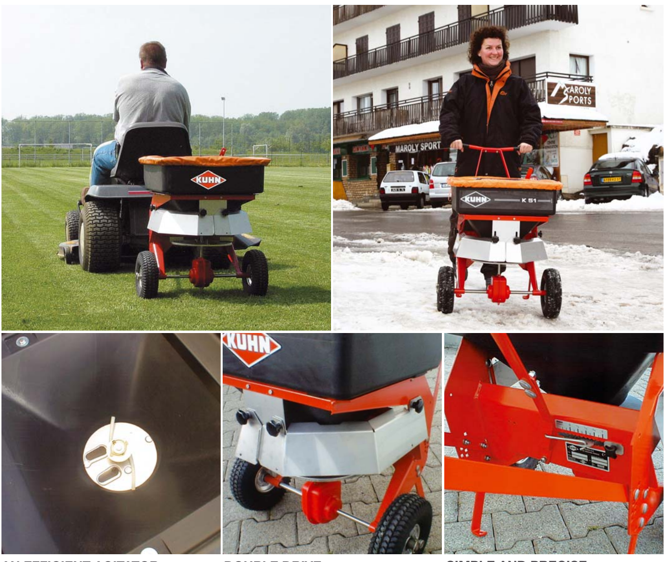
AN EFFICIENT AGITATOR

The K 51 versatile spreaders can spread salt, sand, gravel and fertilisers. In winter, they will ensure pedestrians' safety when walking on paths, sidewalks and public or private roads. In spring or summer, they can be used for park maintenance (fertiliser applications on lawns, sanding, etc.).Thanks to its original design, the K 51 can either be hand-pushed or pulled for example by a small tractor. The modification from pushed to pulled version only takes a few minutes.